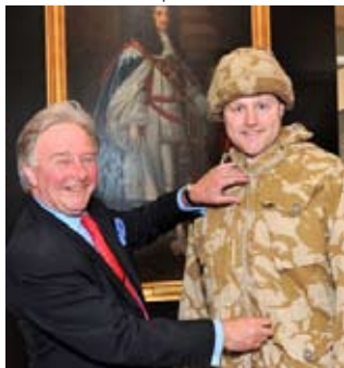
Smarten up laddie! The House Cavalry Museum has been combined with an Encore Buckingham Palace tour.

The State Rooms at Buckingham Palace are open to public again this summer and Encore Tickets has put together a combination for coach tour operators: a Palace tour and cream tea for just £29.