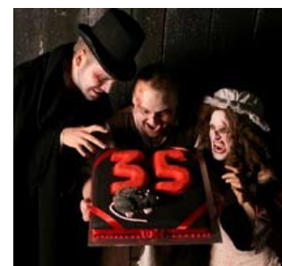
The London Dungeon

New for 2010 is Bloody Mary: Killer Queen, featuring one of England's most feared rulers - Mary Tudor, the deadliest daughter of Henry VIII. With thirteen other twisted experiences from Jack the Ripper to Sweeney Todd - PLUS two chilling rides and live actors intent on scaring anyone in their path. Open seven days a week www.thedungeons.com