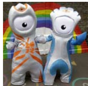
Wenlock and Mandeville

"This could only be the work of a committee; it screams CC'd creativity," A.A. GILL, British columnist, on the newly unveiled 2012 London Olympic mascots, Wenlock and Mandeville