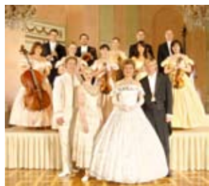
Mozart & J. Strauss Concert Daily 6:30 & 8:15 p.m Imperial Dinner before or after the concert.

Vienna Residence Orchestra Palais Auersperg Auerspergstrasse 1, 1080 Wien Tel.+43 1 817 21 78 Fax: +43 1 813 28 65 Email: konzert@residenzorchester.at www.vro.at