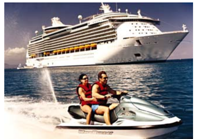
Cruise operators performed well

State of the Nation 2010 is endorsed by ABTA and BHA and sponsored by VT Group and EDI.