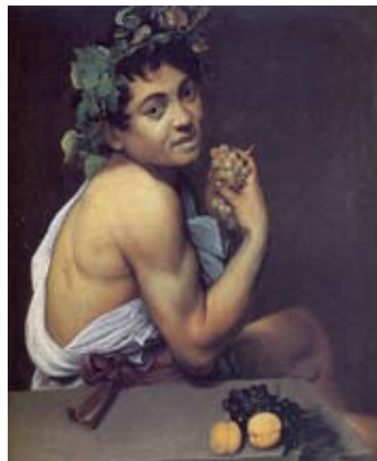
Caravaggio 1571-1610 self-portrait as Bacchus 1593-4

Britain's museums and galleries are fairly unusual among their