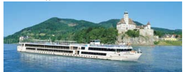
The Viking Legend

All public areas, including the restaurant, bar and lounge, will be refurbished. Additionally, eight 180-square-foot deluxe staterooms will be created on the upper deck.