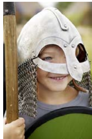
A Viking warrior

ship, with a detailed history through to the 1700s. For full details www.ribe1300.dk