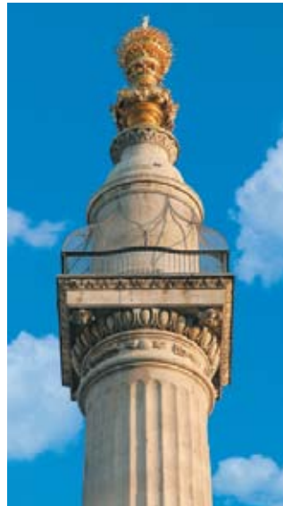
London's restored Monument

The Monument will now go forward to compete with the other regional winners in the Awards Grand Final, which takes place in October.