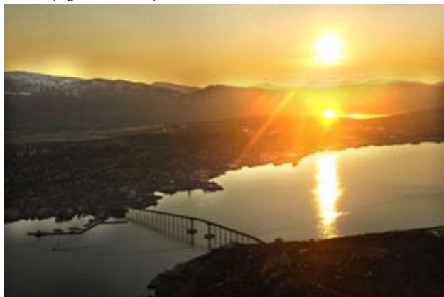
Norway - Land of the Midnight Sun