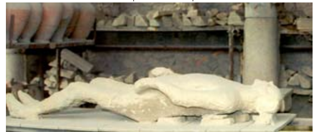
Pompeii - A victim of Versuvius

Anyone caught trying to tout for customers outside these spots, either on the site itself, in the parking lot or near the ticket office, will be forcibly removed from the site and reported to the police.