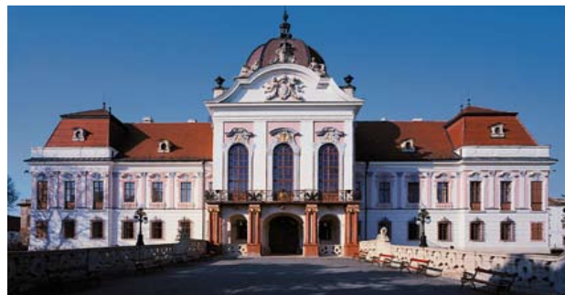
Facade of the Palace

Today as well as visiting the splendid Palace, its gardens and Museum, throughout the year there are a host of additional events including chamber concerts, opera and operetta, advent and Christmas celebrations To visit the Palace and museum with group, informacio@kiralykastely.hu or by phone: T+36 (0)6 28-410-124