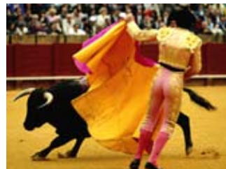
"Did not have the balls"