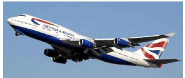
APD will hurt long haul carriers operating from the UK