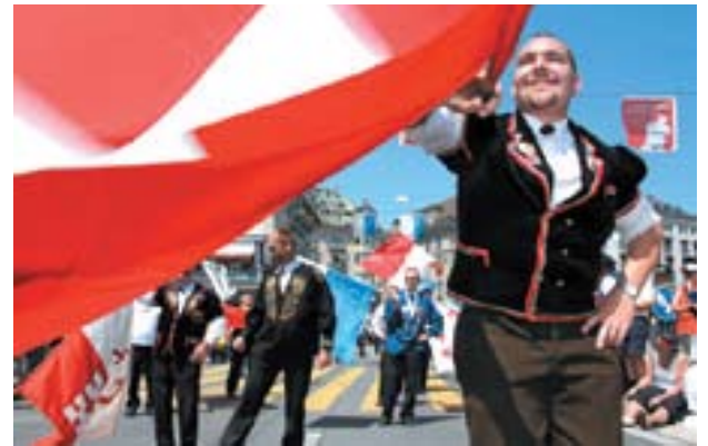
Swiss Yodeling Fest

Travel with one of the trains reserved especially for the event. A round-trip ticket from wherever you board. One of the designated trains costs a flat fee of CHF 59. Combination tickets for the afternoon opening ceremony and the evening event are available starting at CHF 25. Order tickets at www.ejv.ch/jubilaeum .