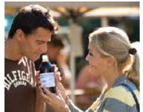
Sampling the local delicacies