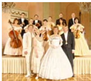
Mozart & J. Strauss Concert Daily 6:30 & 8:15 p.m. Imperial Dinner before or after the concert.

Vienna Residence Orchestra Palais Auersperg Auerspergstrasse 1, 1080 Wien Tel. +43 1 817 21 78 Fax: +43 1 813 28 65 Email: konzert@residenzorchester.at www.vro.at