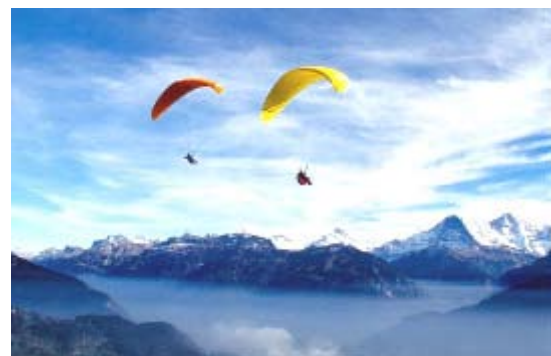
Paragliding in Interlaken

Partners under the Interlaken Tourism umbrella brand also have numerous celebration specials lined up for holders of a Guest Card. Every two weeks in June and September, the idyllic village of Bönigen will offer visitors a free horse-drawn carriage ride. And in June, a racy scooter-bike ride from the Niederhorn down to Beatenberg will be well worthwhile with half-price scooter rental. In Beatenberg, tennis fans can enjoy one hour on the court for free in July