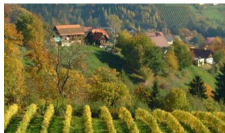
Styrian vineyards and countryside

Geographically speaking, Graz is situated in a basin which opens to the hilly countryside of the Styrian wine-growing region in the south and which is bordered by the alpine pastures of the eastern foothills of the Alps in the north.