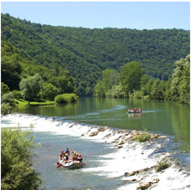
Kolpa River EDEN Destination 2010_Foto RIC Bela Krajina

All the finalists of the EDEN selection in Slovenia will also have the opportunity to collaborate, link up and transfer knowledge and exchange experiences with European destinations within the framework of a web forum running since 2009 as part of the website www.edenineurope.eu under the leadership of the European Commission.