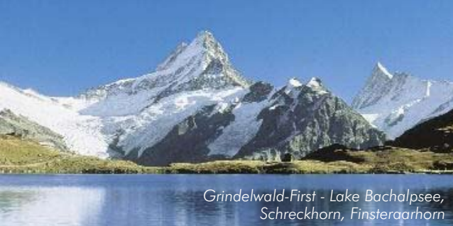
Grindelwald-First - Lake Bachalpsee, Schreckhorn, Finsteraarhorn