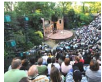
Regent's Park Open Air Theatre

Celebrating Stephen Sondheim's 80th birthday, the season closes with his 1987 musical Into the Woods Perfectly placed within the Open Air Theatre amphitheatre, the stories of the Brothers Grimm are given a dark and humorous twist. www.openairtheatre.com