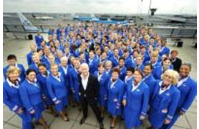
KLM - new togs