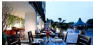
Raffles Singapore - Restaurant Alligator Pear

The luxury 103-room hotel, a favourite watering hole of literary figures including Somerset Maugham and Rudyard Kipling, is said to be set to be acquired from Fairmont Raffles Hotels International by Qatari Diar, part of the state-controlled sovereign wealth fund, the Qatar Investment Authority.