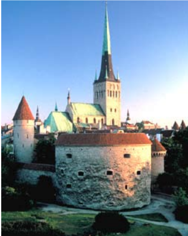
St. Olaf's Church and the Tower of Fat Margaret

This small country is also highly technologically developed. It is 30th in terms of the world's highest number of internet users, Skype was invented by an Estonian, most Estonians pay their taxes and bank online and their car park fees by mobile phone, yet the country is closely rooted to its nature and heritage.