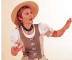
Sound of Salzburg Dinner Show

Sound of Salzburg Dinner Show Office: Zwieselweg 10, A-5020 Salzburg Tel: +43 662 826 617 Fax: +43 662 826 617-1 E-m: reservation@soundofsalzburg-show.com www.soundofsalzburgshow.com Performance takes place at the Sternbräu Dinner Theatre with special net rates for Tour Operators & Groups.