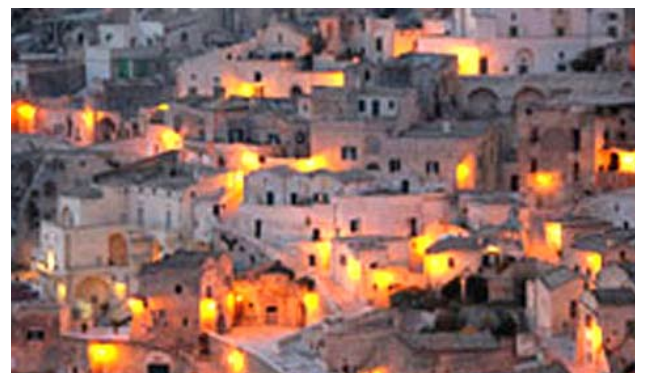
Basilicata - Italy

Food is traditional and robust and almost always locally sourced with fish a speciality on the coasts and further inland, local specialities include the famous Basilicata bread, Mischiglio pasta, Salami and the excellent red wine Aglianico del Vulture. www.discoverbasilicata.com/uk