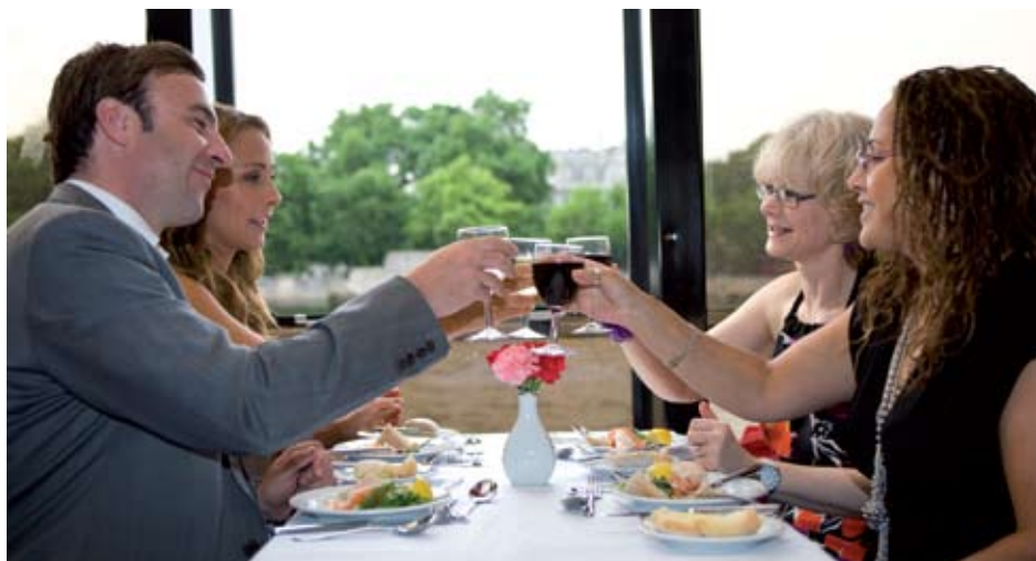
Showboat – cheers!!

The London Showboat , an unforgettable evening of top quality entertainment and superb food will operate from November until the end of December 2009 every Thursday, Friday and Saturday. In January and February 2010 it will operate on Fridays and Saturdays and during March 2010 on Thursdays, Fridays and Saturdays.