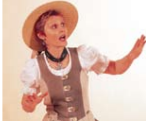
Sound of Salzburg Dinner Show

Sound of Salzburg Dinner Show Office: Zwieselweg 10, A-5020 Salzburg Tel: +43 662 826 617 Fax: +43 662 826 617-1 E-m: reservation@soundofsaltzburg-show.com www.soundofsaltzburgshow.com Performance takes place at the Sternbräu Dinner Theatre with special net rates for Tour Operators & Groups.