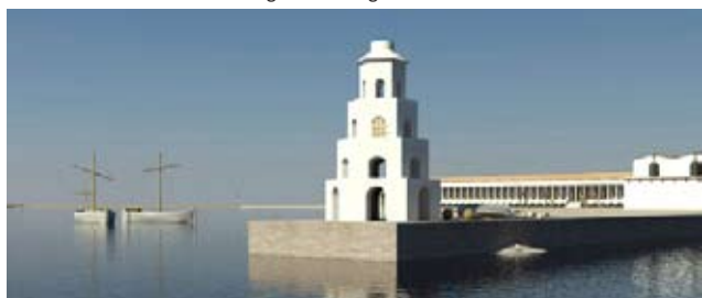
Portus lantern