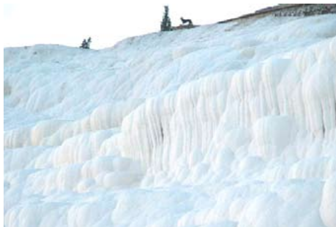
The frozen silent waterfall of Pamukkale

On The Road is available as a download in PDF format at: