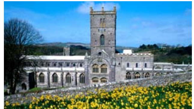
St David's Cathedral

With cathedrals in St. David's, Llandaff (Cardiff) and St. Asaph (reputedly Britain's smallest), historic religious sites such as the sacred Bardsey Island off the Llyn Peninsula and St. Illtyd's Church in Llantwit Major with its important collection of ancient Celtic stones, A 'Factfile of Religious Tourism' is available from www.travelwales.org/religious. Specialist tour operators include www.cambrianroutes.com/saints-stones and www.pilgrimtravel.com