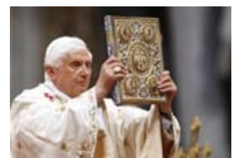
The Pope canonising 5 new saints