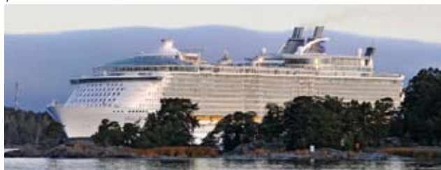
Oasis of the Seas

But he said if revenues were to bounce back to the heady days before the recession, the cruise marketers would have to look beyond the silver-haired and attract a younger crowd. He also added that although the stereotype persists, Royal Caribbean had defied that stereotype for years.