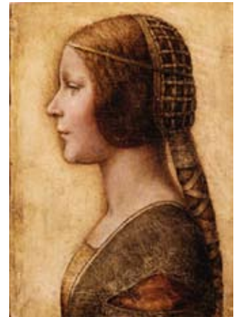
The new masterpiece