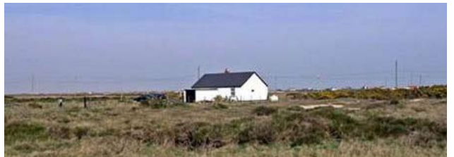
Estate Agents cottage

A spokesman for the agents, Geering and Coley based in nearby New Romney told the Daily Telegraph, "The thing is that anywhere on Dungeness is close to the nuclear power station - it's a place you either love or hate - people can always go to Google Earth and check it out." Hmmm, what ever happened to honesty is the best policy?