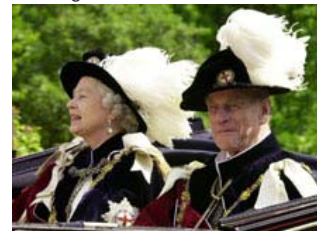
Queen Elizabeth & Prince Philip