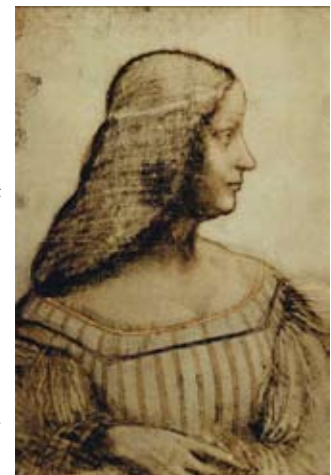
Isabella D Este drawing in the Louvre