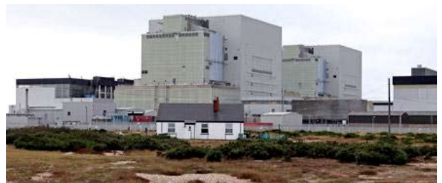
The real cottage