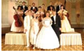
Mozart & J. Strauss Concert Daily 6:30 & 8:15 p.m. Imperial Dinner before or after the concert.

Vienna Residence Orchestra Palais Auersperg Auerspergstrasse 1, 1080 Wien Tel: +43 1 817 21 78 Fax: +43 1 813 28 65 Email: konzert@residenzorchester.at www.wro.at