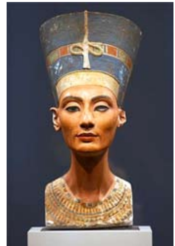
Berlin's most treasured museum exhibit -- the bust of Egyptian Queen Nefertiti.