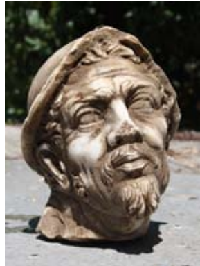
Portus marble head