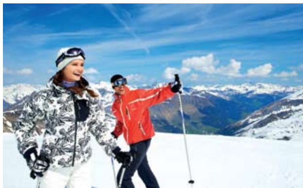
Having fun in the Tirol © copyright 2004 Tirol Werburg