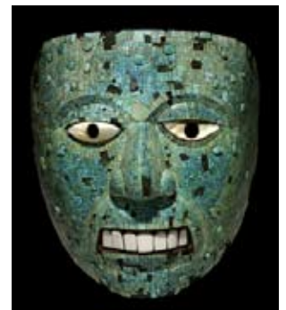
Turquoise Mosaic Mask, Aztec - Mixtec AD 1400 - 1521, Mexico.

The legacy of this tumultuous event and the semi-mythical status of Moctezuma will be reassessed through the display of imposing stone sculptures and rare gold and turquoise objects, many of which will be seen for the first time in the UK. www.britishmuseum.org