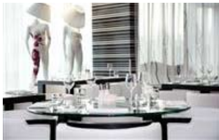
Fashion Hotel Amsterdam