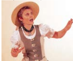
Sound of Salzburg Dinner Show

Sound of Salzburg Dinner Show Office: Zwieselweg 10, A-5020 Salzburg Tel: +43 662 826 617 Fax: +43 662 826 617-1 E-m: reservation@soundofsaltzburg-show.com www.soundofsaltzburgshow.com Performance takes place at the Sternbräu Dinner Theatre with special net rates for Tour Operators & Groups.