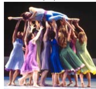
Mark Morris Dance Group

Following The Royal Ballet's first visit to Cuba in July this year, principal guest artist Carlos Acosta will appear with Ballet Nacional de Cuba in London as part of Spring Dance at the London Coliseum in 2010. It will be the first time the Cuban company has performed at the London Coliseum and the first time Cuban superstar Carlos Acosta has performed with the whole company in the UK.