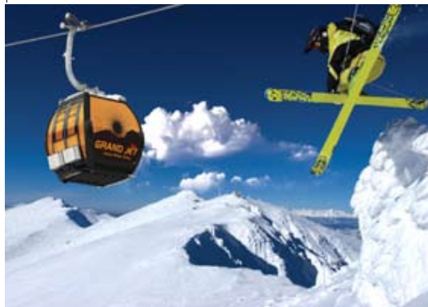
Jasna GrandJet mix

There will also be a completely new 700m long ski slope in the Otupné sector, which will be located to the east of the ski run Vrbická. The new run will provide a bypass to a steep part of the Vrbická piste. www.jasna.sk