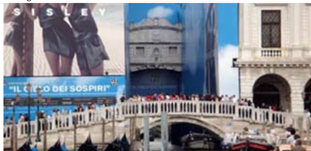
The changing face of Venice

The mayor defended the advertising hoardings, saying he had little choice. "They're the result of turning to private sponsors to pay for restoration," he said. The buildings are covered to protect the public during the restoration work.