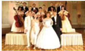
Mozart & J. Strauss Concert Daily 6:30 & 8:15 p.m. Imperial Dinner before or after the concert.

Vienna Residence Orchestra Palais Auersperg Auerspergstrasse 1, 1080 Wien Tel: +43 1 817 21 78 Fax: +43 1 813 28 65 Email: konzert@residenzorchester.at www.wro.at